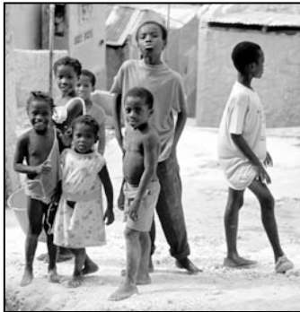
The current political situation in Haiti threatens children and families who already live in extreme poverty.