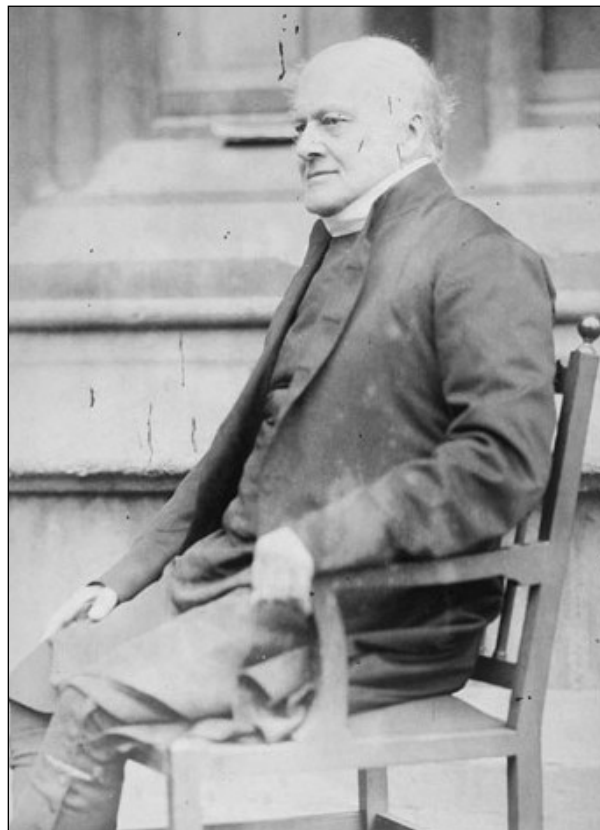
Charles Longley, 92nd Archbishop of Canterbury

Even so, the Archbishop of York declined the invitation and only a bare majority (76 of 144) of the world’s Anglican bishops showed up. They met for four days and the major excitement came when the Archbishop of Capetown, Robert Gray, brought up the matter of the Bishop of Natal, John William Colenso, who had done great work among the Zulus but upset the archbishop by his advanced views of Biblical scholarship. In an uncanny preview of current events, the archbishop declared Colenso to be heretical and sent a new bishop to serve the same area. Colenso stuck to his guns and his diocese and is now revered by the Church in South Africa.