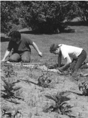
in the garden