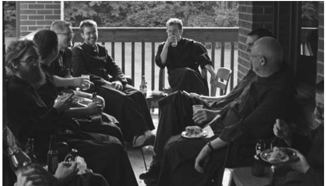
Sunday supper on the deck