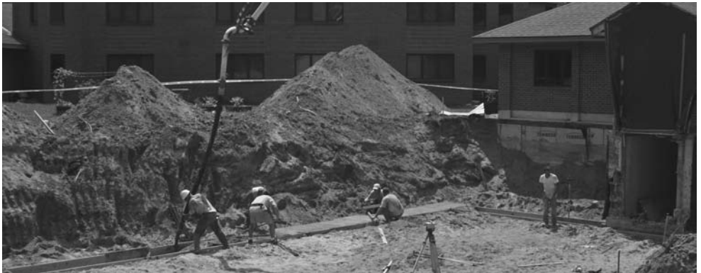
pouring the foundation for the new building

Our July Vocation Program was filled to capacity this year. Some of the participants expressed further interest in monastic life and might possibly join us in the future for more discernment.