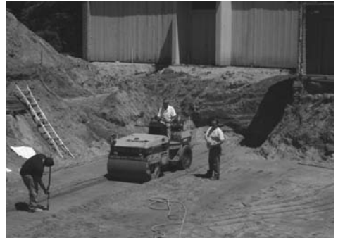
preparing the ground for the new building