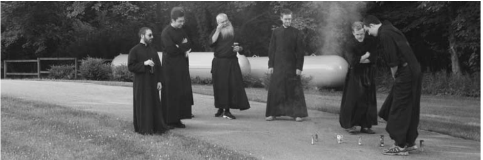
Independence Day fireworks