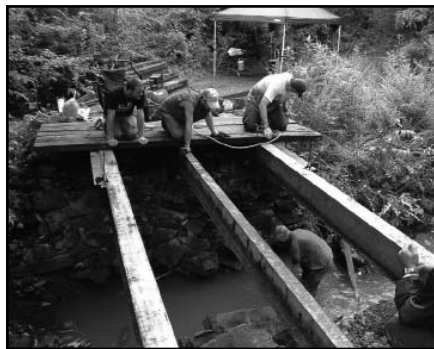
Volunteers construct bridge over creek during 2007 work week. Bridge connected elderly resident's home to road, making it easier to transport fuel and other supplies.

The Episcopal Church, at its 70th meeting of General Convention in Columbus, Ohio, in 2006 included $50,000 for Episcopal Appalachian Ministries in its triennial budget, as well as a new line item of $70,000 for the triennium for Appalachian Initiatives.