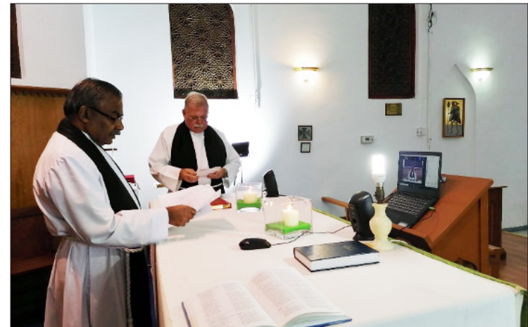
Worship during the pandemic at St. Christopher's Cathedral, Bahrain. Note the laptop on the lectern.

Without a living Christian presence, Christianity in the Middle East will become a collection of museum sites rather than a vibrant and life-affirming presence of Christians whose faith tradition dates to the first Pentecost. The Good Friday Offering is an expression of our solidarity with our sisters and brothers in Christ who keep the faith alive throughout the Land of the Holy One.