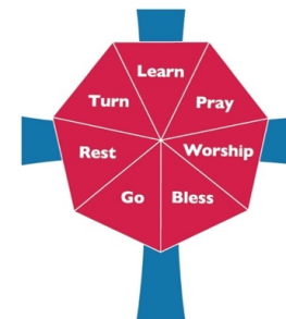
THE WAY OF LOVE Practices for Jesus-Centered Life

For more Advent resources related to the Way of Love, visit episcopalchurch.org/wayoflove . There, you’ll find links to the full Advent curriculum Journeying the Way of Love , as well as Living the Way of Love in Community , a nine-session curriculum for use anytime.