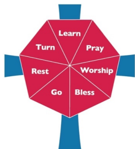
THE WAY OF LOVE Practices for Jesus-Centered Life

For more Advent resources related to the Way of Love, visit episcopalchurch.org/wayoflove . There, you’ll find links to the full Advent curriculum Journeying the Way of Love , as well as Living the Way of Love in Community , a nine-session curriculum for use anytime.