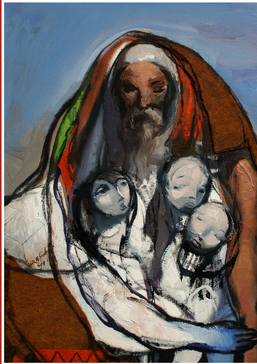
The Compassionate, by Qais Al Sindy, 2019

Your gifts on this poignant day of the church calendar bring renewal and new life to those who live and serve where Jesus walked.