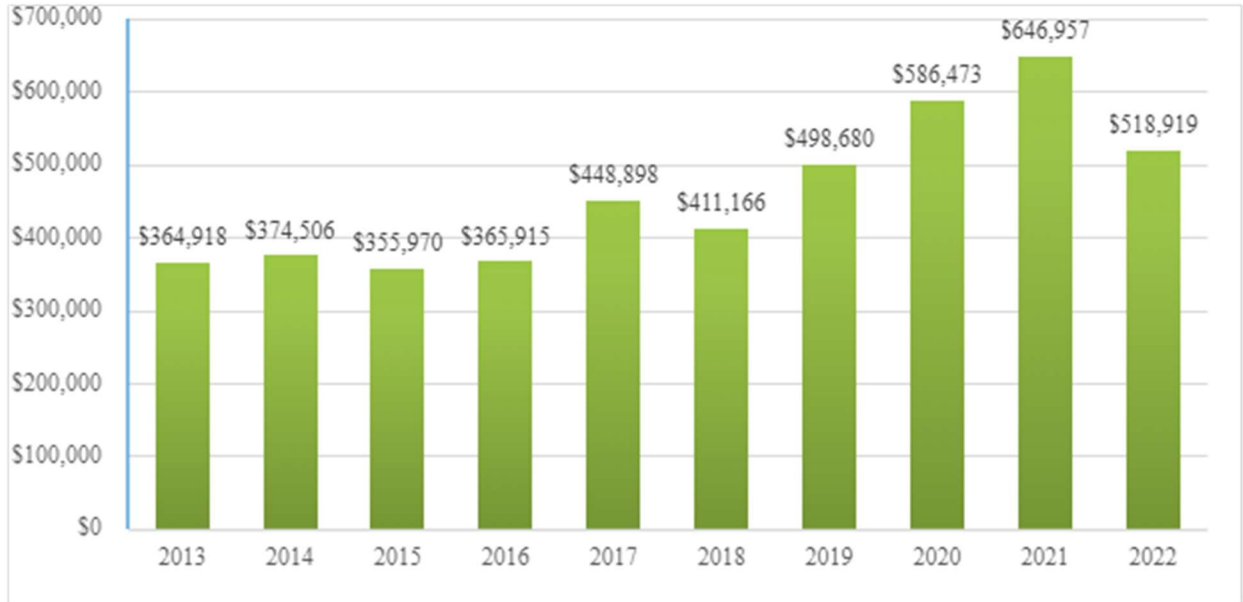
Portfolio Value 2013-2022 (000's)

The chart below summarizes the valuation of the portfolio since 2013.